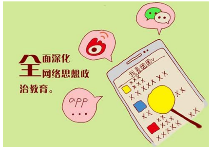
Figure 2 Combination of new media platform and ideological and political education

development results. Therefore, in the development of ideological and political education, it is necessary to use information technology to innovate the carrier of ideological and political education. For example, the use of QQ、 WeChat, Weibo, everyone and other new media platforms (as shown in figure 2) to make ideological and political education continue to deepen, prompting the socialist theme education to continue to strengthen. The combination of ideological and political education and new media platform can promote the positive dissemination of social energy and make students learn ideological and political education in a subtle way.